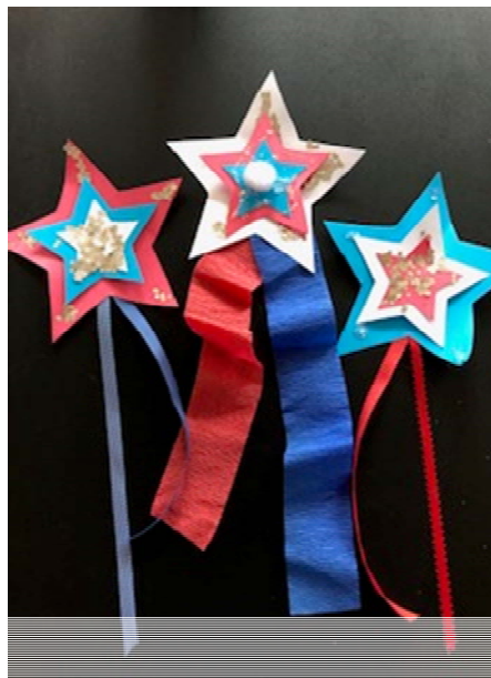
Shooting Stars - stacked