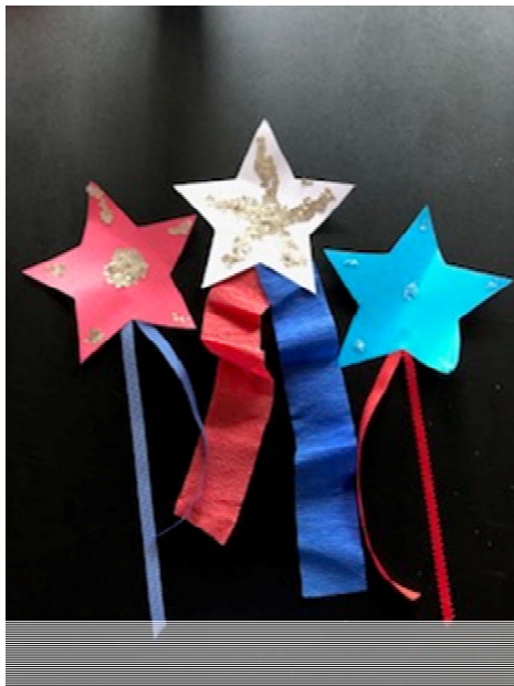
Shooting Stars – single