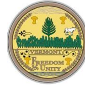
Peter Shumlin Vermont